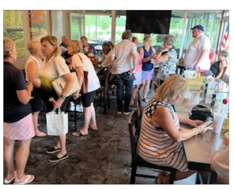
Above, contestants from the Sip 'n' Chip Par 3 tourney crowd the bar area following the event, which began with an optional shot on the patio and included two drink stations on the nine-hole course