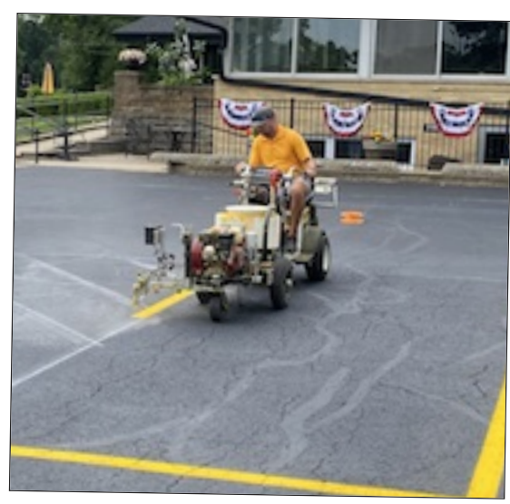
Above left, Lakeside Sealcoating workers seal the parking lot June 2. Above right, a workman from Effingham Striping Service paints parking lines. The work cost about $14,000 and so far members have donated $4,725 to cover the cost. Donations are still being taken.